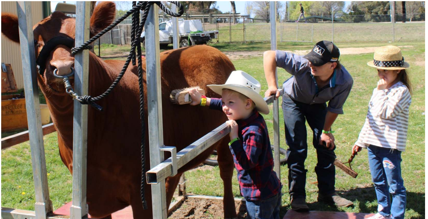
Little Stewards learnt the finer points of show preparation and experienced fleece and meat sheep and alpacas, handled fleece, and decorated biscuits.